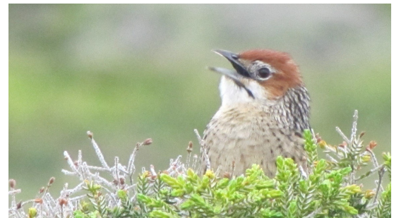
Our friendly grassbird