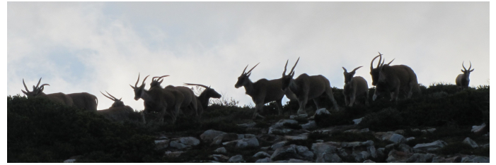
Eland silhouetted above Peagrams Point (seen on the recce)

Limestone Ridge and we hoped we might get a glimpse of them again later on.